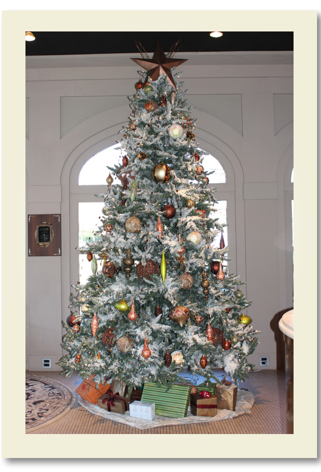
We wish you the best for 2017!