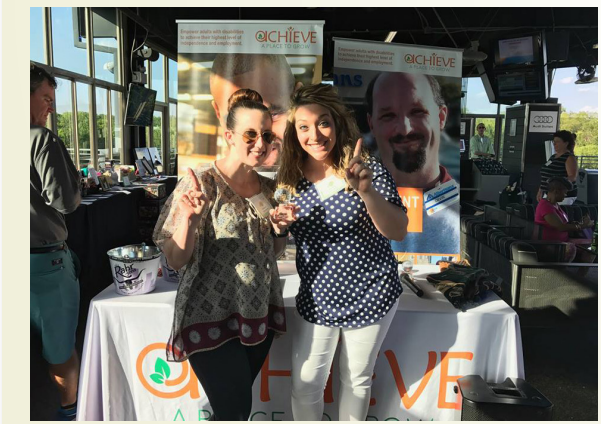
We were proud to be one of the sponsors for Achieve DFW's event at Top Golf Dallas.