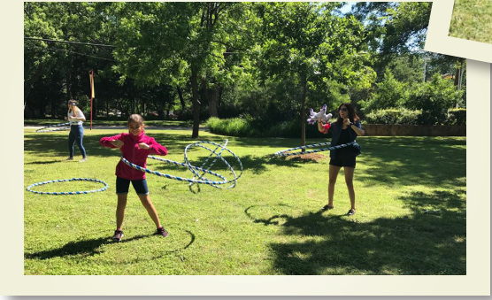
Texas Scottish Rite Hospital's Farm and Ranch Day at Reverchon Park.